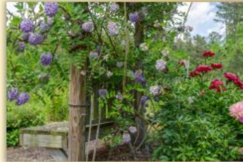
2015 photo contest winner by Sandy Cetin

Enter our Spring photo contest! Submit your best shots taken at Freedom Park this spring. The winning photo will be displayed in the Freedom Park Interpretive Center and will be featured in Freedom Park Now!